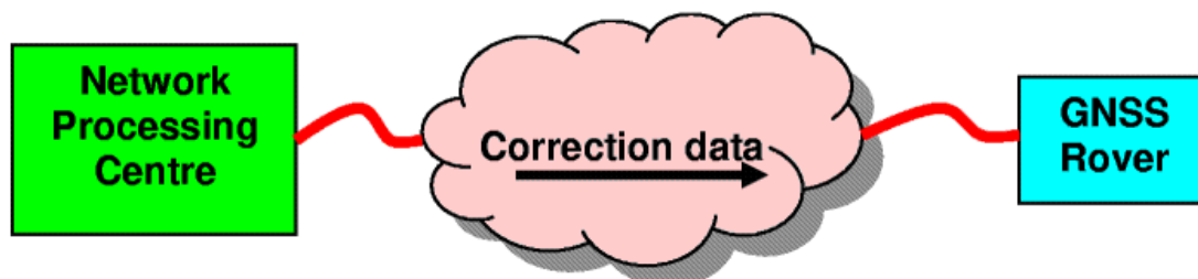
Fig. 3: Communication in simplex operating mode.

Communication channels operating in simplex mode have the advantage that they can serve an infinite number of users. An important advantage of duplex mode operation is the ability to identify each user individually for billing purposes.